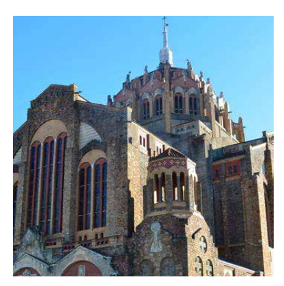
♦ TIES TO THE LOCAL AREA

By participating in the creation of a vocational training course in computer science in Cholet (France).